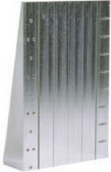
5-Groove Wedge Heavy Metal made of stainless steel

Simple to set-up and use universal test wedge according to ASTM E2737 - available in two versions. Selection shall base on the most stringent material used in the application.