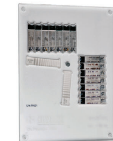
DR Phantom TAM