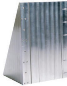
5-Groove Wedge Light Metal made of aluminum